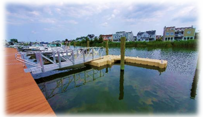
New Floating Dock installed on Perrine Blvd for boater's convenience